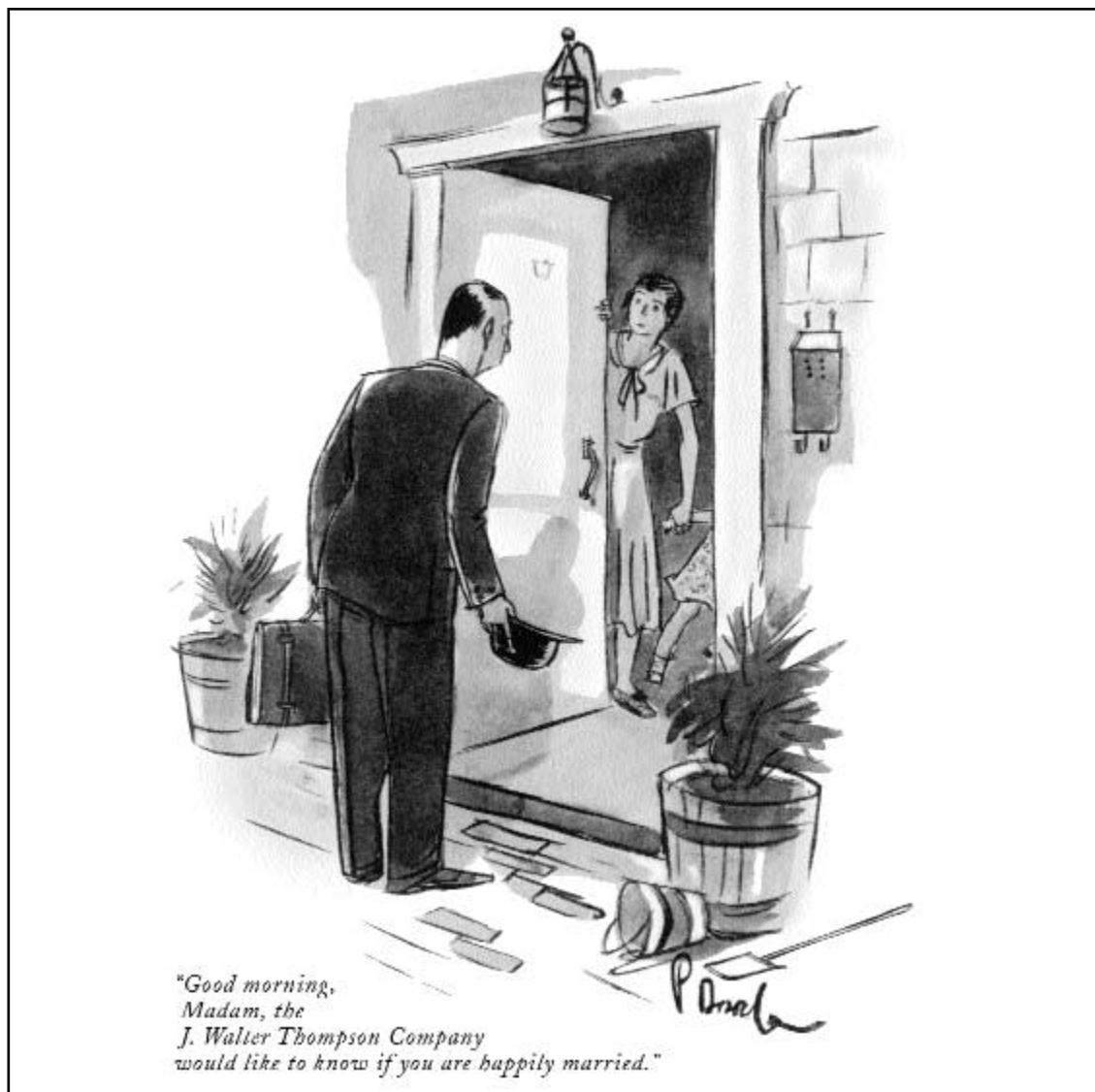
At left

Does divorce make unhappily married people happy? The answer, surprisingly, in this research, seems to be no. Divorce typically offered unhappy spouses no relief in terms of symptoms of depression, and was not associated with increases in personal happiness or other measures of psychological well-being.